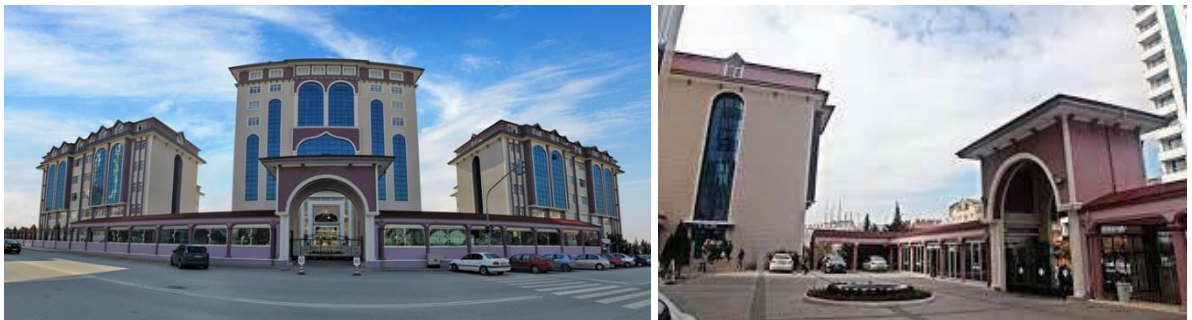
Figure 10. Buildings with arches, buttresses, and eaves and portals at Ankara Yıldırım Beyazıt University

In Etlik campus named as National Will Building of Ankara Yıldırım Beyazıt University (Figures 10), there are Rectorate, School of Foreign Languages, Faculty of Health Sciences, Sports Sciences. In this building, round arches, Bursa arches used together with modern forms and at the entrance gate the buttresses under the moldings, wide eaves referring to historical forms, sub-eaves buttresses, columns have referenced to second National Architectural period.