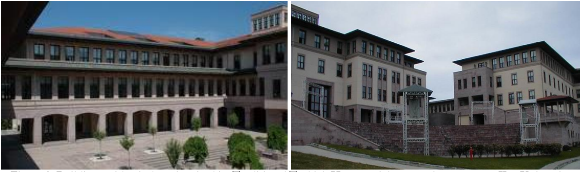
Figure 8. Buildings with windows inspired by Traditional Turkish House, oriels, eaves, buttresses, at Koç University Rumelifeneri Campus