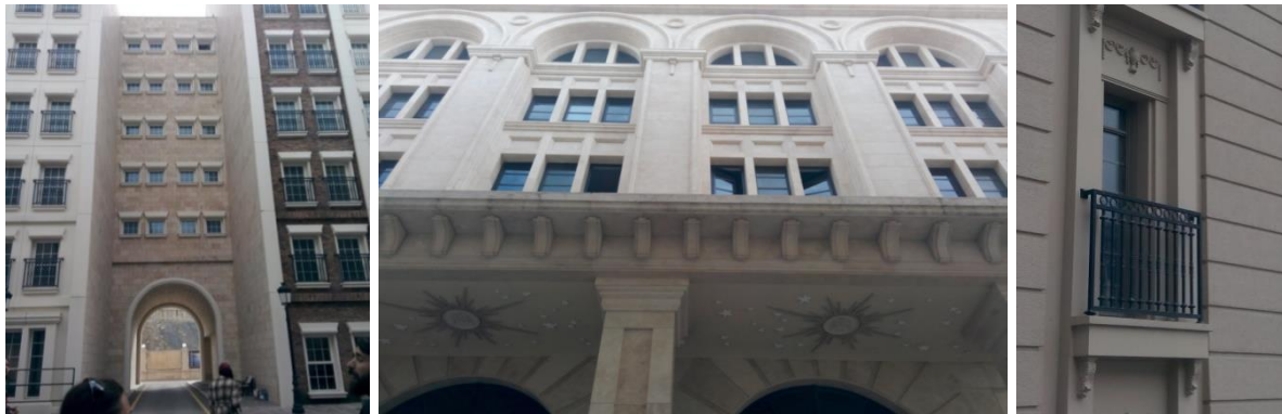
Figure 4. Facades and details inspired by Venetian, French and Roman architecture at the campus of Ankara Music and Fine Arts University