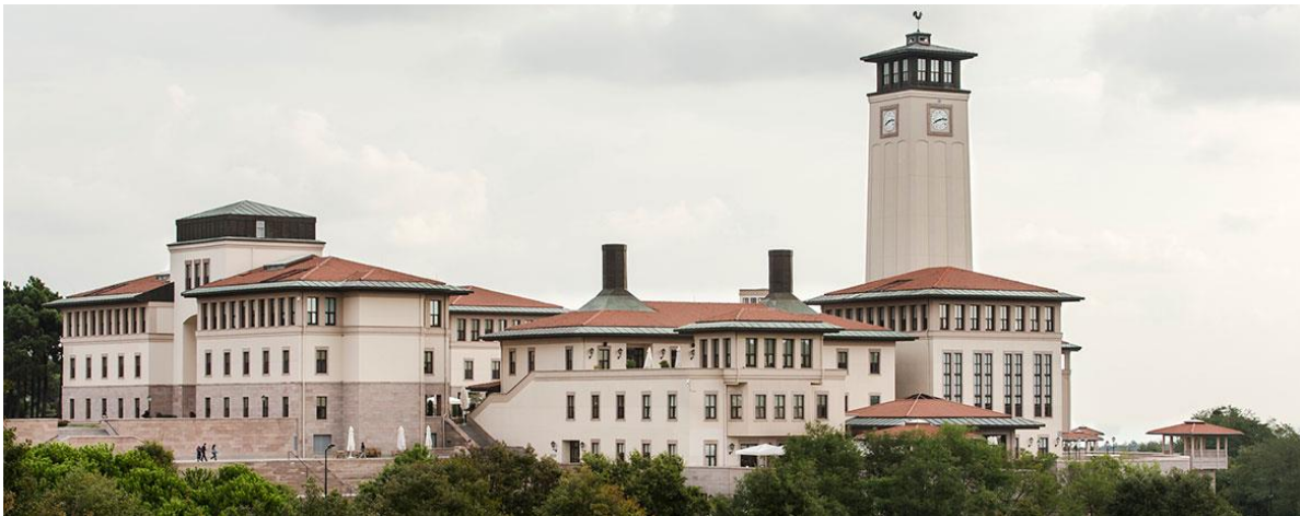
Figure 7. Traditional Turkish House-like building facades in Koç University Rumelifeneri Campus

The Rumelifeneri Campus of Koç University founded in 1993 by the Vehbi Koç Foundation, which was opened in 2000, consists of 60 buildings with faculty buildings, laboratories, library, dormitories, housing, sports, and social facilities in Istanbul Sarıyer on an area of 25 hectares. The complex which emulates the ‘ Traditional Turkish House ’ and the ‘ Second National Architecture ’ movement which is stylized with the characteristics such as wide eaves, moldings, and oriels is the work of the Iranian-American architects Mozhan Khadem living in Boston (Figure 7, 8).