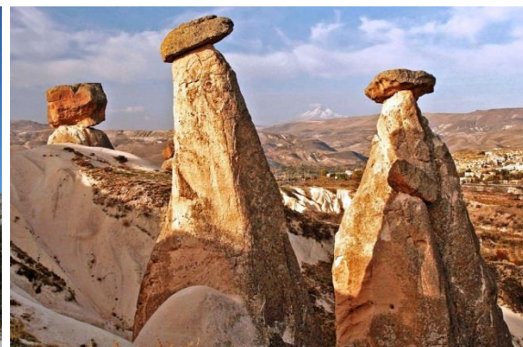
Figure 13. Hoodoos (fairy chimneys) in Nevşehir

In recent years, elements imitating the Seljuk portals, which are stylized in an orientalist way, have been used predominantly in most universities. Proportions they are gathered from historical form have been used by distorting in these structures that are constructed as high-rise thanks to the modern materials and facilities provided by modern technology. Postmodern ‘orientalist’, ‘neoclassical’, ‘eclectic’ and ‘kitsch’ styles can be found at university campus gates also. There are campus gates that use forms derived from local architectural symbols, or a famous historical building of the city where it is located and refers to the classical Greek, Roman, Renaissance, Neoclassical, Seljuk, Ottoman, Turkish national architectural styles and the concept of ‘Turkish house’. As some examples of these (Table 1), Ankara Music and Fine Arts University campus gate (Figure 14), which uses forms from Classical Greek, Roman, and Renaissance architecture such as column, capital,