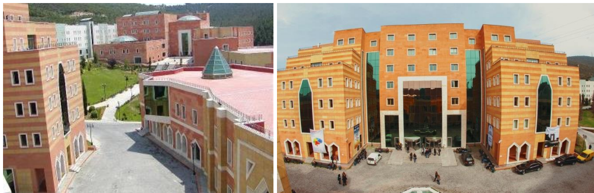
Figure 5. Buildings with portals, cones and riwaqs inspired by the Seljuk period at Yeditepe University

It is entered through gates to the buildings inspired by the iconic portal tradition of the Seljuk architecture reaching 22 meters in height (Figure 5). These forms are detached from time and far from the proportions of the Seljuk period works from which they are gathered.