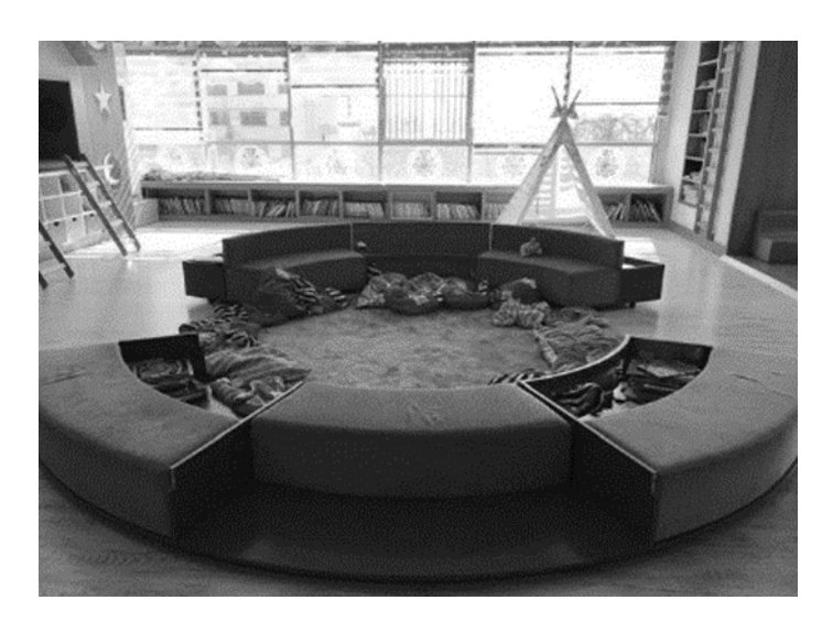
Figure 10. Natural lighting

there are building elements in the space to control the sun, it is not enough. The inner walls of the building are painted in white and light colour is preferred on the floor. In this way, it is ensured that the space is brighter and more spacious.