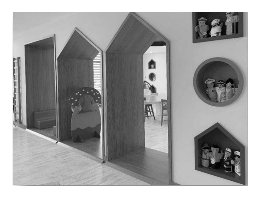
Figure 9. Use of laminate flooring

library moderately, 20% evaluated it well, and 15% evaluated it very well. It is emphasized that the evaluations of the users and the data obtained because of the measurements are similar. The results of this study and the study conducted by Kuru, Canbaz Türkyılmaz (2019) are me. In this direction, different sound insulation solutions are required for each section of libraries.