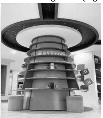
Figure 7: Circular study and book storage area of the library

content and data banks (Seljuk Municipality KPP Children's Library, 2022). The storage of the collections of the library was done in two ways. First, the seating area in the centre of the library also serves as a book storage (Figure 4). Another storage element is designed with the function of working in circular form and storing books (Figure 7).