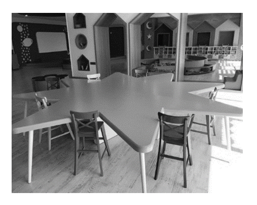
Figure 14. Event place, dream table.

veneer. Although wood is positive in terms of human psychology, wood is a dangerous material in terms of fire. Thanks to the laminate coating used in the furniture, both the feeling of wood is created in the psychology of people and the accidents that may occur in case of fire are reduced. Transparent protectors are not placed on the surface of the tables, which can prevent injuries that may occur in accidents (Figure 14). In addition, some details in the library, such as cabinet doors and hangers, are made of unnecessary designed and poor-quality materials.