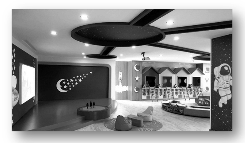
Figure 5. Game room with space visuals

In addition, in the Children's Libraries Workshop held in 2018, "reading, learning, entertainment and recreation areas", "child-oriented areas", "areas for disadvantaged groups", "activity areas for familychildren", "interaction areas", activity areas that contribute to the development of creativity (Lego, DIY workshops, etc.), "nutrition areas" and "children's playgrounds in the library garden" (Polat, Yılmaz, & Kakırman Yıldız, 2018). In this study, the space of the library is designed with the "space theme" (Figure 5). This is important in terms of processing the "space theme" in the space design and creating a "new dream world" for children and being the first and only example of the city. The adoption of the thematic design, which aims to attract the attention of children and is decorated with space visuals, may be interesting for children to ensure repeated visits.