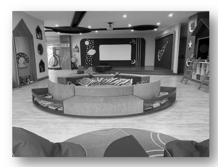
Figure 4. Collective book reading area.

emotional, spiritual, and social development of children (Tapkı and Canbay Türkyılmaz, 2018). With this logic, it should be ensured that libraries adapted to all developmental periods of childhood are created and continuous updates are made to meet the needs of generations.