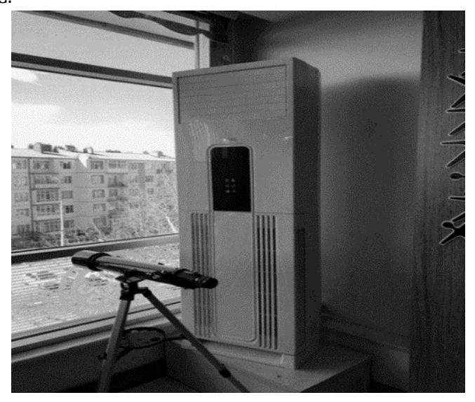
Figure 12. Saloon type split air conditioner

temperature inside the library doubled the deterioration in books. For this reason, it is emphasized that daily temperature changes should not exceed 1 ^{\circ} C.