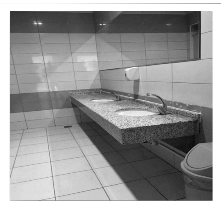
Figure 8. Children's washbasin

In multi-storey public libraries, it is more convenient to have toilets on each floor. The materials used for toilets must be of excellent quality. Ventilation and windows in toilets should be adequate. Iron railings should be installed on the windows. Criterion 8. Noise factors by age range