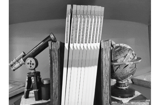
Figure 13. Different shelf design for children

The purpose of ergonomics in children's libraries is to ensure that the environment is arranged according to child users. In the design of children's libraries according to ergonomic conditions, it is ensured that productivity is increased by creating areas suitable for children's ages, anthropometric characteristics (Erten Bilgic and Surur, 2016), perceptions and thought structures. Areas designed by considering ergonomics criteria support the physical, mental, and social development of the individual on the one hand and play a vital role in the formation of positive health behaviours and the reduction of the risk of accidents on the other hand. In this study, when the bookcases are examined, it is seen that the depth of the single-sided shelves is between 25 and 35 cm and the depth decrease as the shelves in the middle of the bookshelves are moved to the tops due to the design. The depths of the other double-sided shelves ranged from 55 to 65. It was determined that the transition distances between the libraries varied between 90 and 100 cm. It was determined that the inter-library measurements were suitable for the anthropometric data. The attractive design of the bookcases will allow children to interact more with the books and increase their desire and motivation to learn (Figures 13).