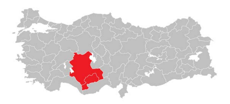
Figure 1. The location of Konya on the map of Turkey

Sample of the Study: The sample of the study was selected from Seljuk Municipality KPP Children's Library. KPP Children's Library was opened in 2019 with a project conducted by Seljuk Municipality, Seljuk District Directorate of National Education and KPP Administration. The library serves children between the ages of 4-10.