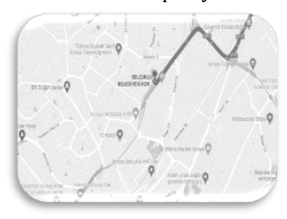
Figure 2. Location of Seljuk Municipality KPP Children's Library

Seljuk Municipality KPP Children's Library is a library that will contribute to the mental and socio-cultural development of our children, to ensure that they are equipped with knowledge and skills, and that has functions as a social development centre (Seljuk Municipality KPP Children's Library, 2022). Although it is easily accessible and designed to allow them to move comfortably in disadvantaged groups, it is located on the third floor (Figure 3). The fact that the library is located on the third floor has limited the child's relationship with the environment. Although it is also important to give the idea that the book can be read anywhere in the book-space relationship, the fact that it is not on the ground floor has caused the child's relationship with the external environment to be broken.