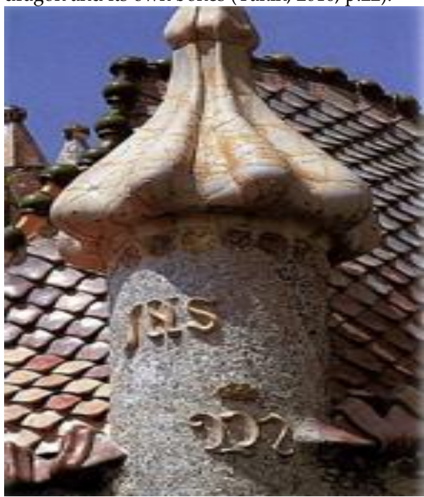
Figure 5. Casa Battlo chimney (Yakın, 2016, p.20)

The structure was named after one of the Catalan saints of the period, St. It describes the war between George and a dragon. Its tower in the form of a cone, stuck in the dragon's back, St. George's sword symbolizes Ascalon. The balustrades on the façade and the mouth forms on the hall façade symbolize the victims killed by the dragon and its own bones (Yakın, 2016, p.22).