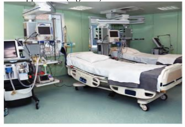
Many hospital rooms are dominated by technology and devoid of any connection to nature.