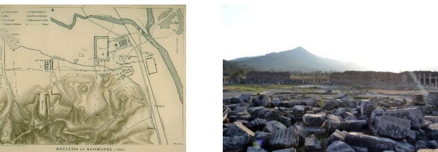
Figure 8. a. Mount Thorax and Magnesia, C.Humann 1904 (Excavation Archives) b. Mount Thorax and Magnesia,2014

The foundation of the new city of Magnesia<sup>5</sup> dates back to 392 BC and was ruled by several dynasties until its abandonment in 14th century AD. (Bingöl 2007) However it is known as a prosperous Roman city. Due to the successive different reigns in control, from Macedonian to Aydınoğulları, buildings are in diversity with regard to their typology and period.