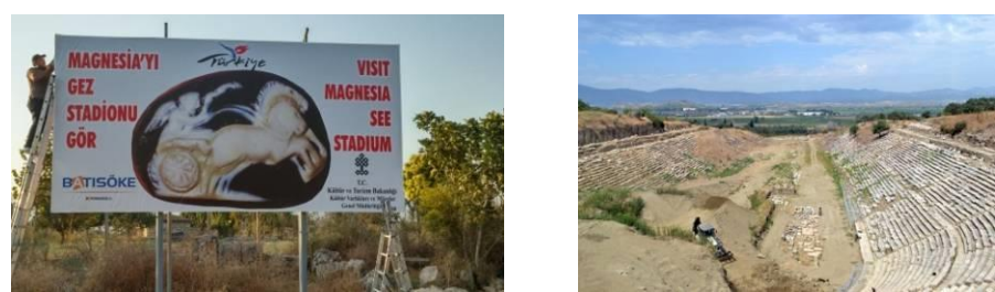
Figure 10. a. Advertising signboard at the main entrance of MAM (Excavation Archives) b. Stadion, 2014

cultural and linguistic diversities should be taken into consideration in a delicate way not put shadow onto the importance and values of the heritage site. In MAM some intimate posters for advertising the site help for attracting any kind of visitors. Hence the intellectual studies should be elevated also in the presentation of the site.