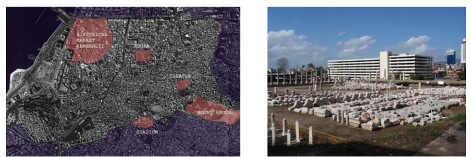
Figure 2. a. The historical places painted in red on the central part of İzmir, b. View from Agora to the city

Rural archaeological settlements are in close relationship with villages or small towns. The modern settlement may have emerged out of the ancient city or in close vicinity of it. Whether they are in one form or another, their relation is mutual. The archaeological site provides cultural development which may result in economic development and cultural tourism as well, if it is managed properly. By these benefits, the ancient city becomes the apple of the residents' eye.