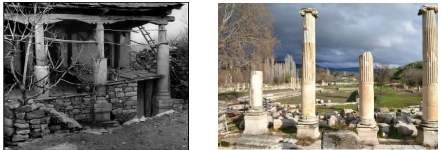
Figure 4. a. Geyve Village, Afrodisias in 1958. b. View from Afrodisias, 2014 [3]

In some cases the village and archaeological site can no longer live together, especially if they are in strong relation physically. Then the village is evacuated outside the ancient site. For instance, Eskihisar Village (Stratonikeia, Muğla, Turkey) is emptied due to coal mines underneath and Geyve Village (Afrodisias, Aydın, Turkey) due to archaeological excavations.