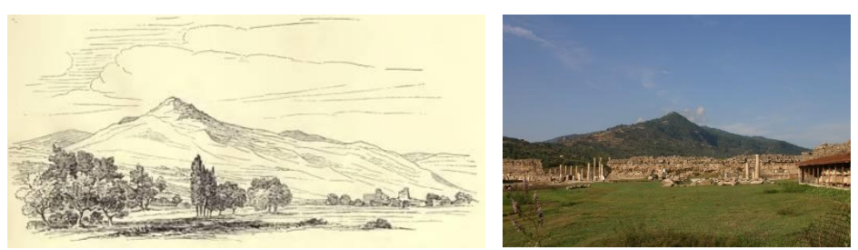
Figure 12. a. Drawing of Mount Thorax and MAM by C.Humann (Excavation Archives) b.Artemision and Mount Thorax (Excavation Archives)

Context and setting constitutes the third principle, which starts with "The Interpretation and Presentation of cultural heritage sites should relate to their wider social, cultural, historical, and natural contexts and settings." A city is consisted of many layers. Unless it is taken with every aspect and dimensions, the interpretation would be lacking. Multilayered historical sites should be reflected via their physical features and spirits. In our case, where the building forms vary from an Archaic Temple to mosque of Beyliks Period, the rich cultural and architectural value need to be readable by both professional and non-professional audiences.