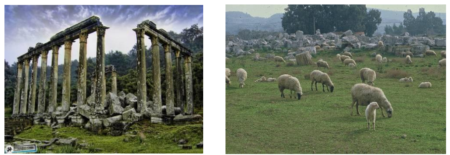
Figure 5. a. Euromos (Milas, Turkey) b. Magnesia on the Meander (Aydın, Turkey) (Excavation Archives) [4] [5]

In this paper, the focus is on a specific case Magnesia on the Meander, which is a natural archaeological site.