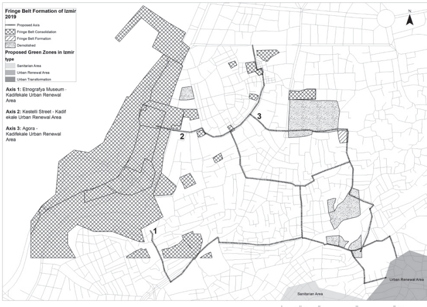
Figure 4. Fringe belts and possible interrelated axis with proposed green belts in Konak