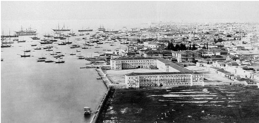
Figure 1. Sarıkışla Military Barrack, 1865 (APIKAM, 2018)