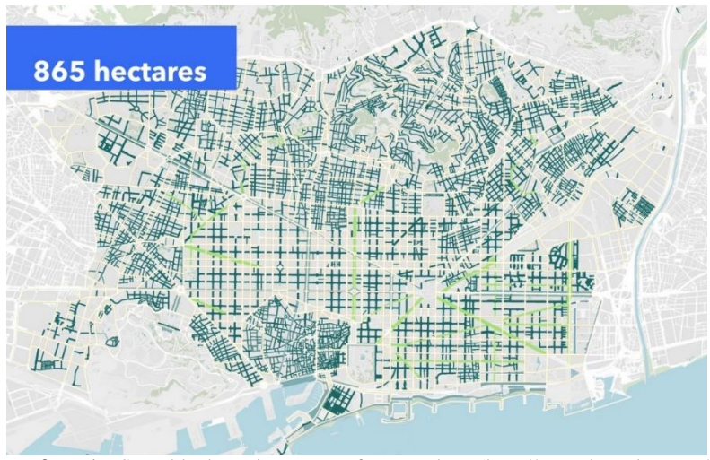
Figure 3. Entire Superblock Design Layout for Barcelona (http://www.barcelona.cat/ca/)