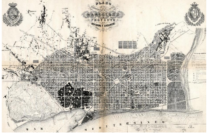
Figure 1. The Cerda Plan, 1859

In Barcelona, Catalan civil engineer, Illdefons Cerda, prepared the first plan for the urban extension, which was considered as a revolution regarding its emphasis on hygiene, easy mobility and transportation on a modern grid-iron urban pattern. Living standards were optimized by creating 6m<sup>2</sup> volume of air per person within the structure of orthogonal city blocks with 113.3 m by 113 m (Figure 1). The pattern was supported with 35m large streets and big avenues. Cerda plan also proposed to increase green spaces and gardens in each block (Wynn, 1979).