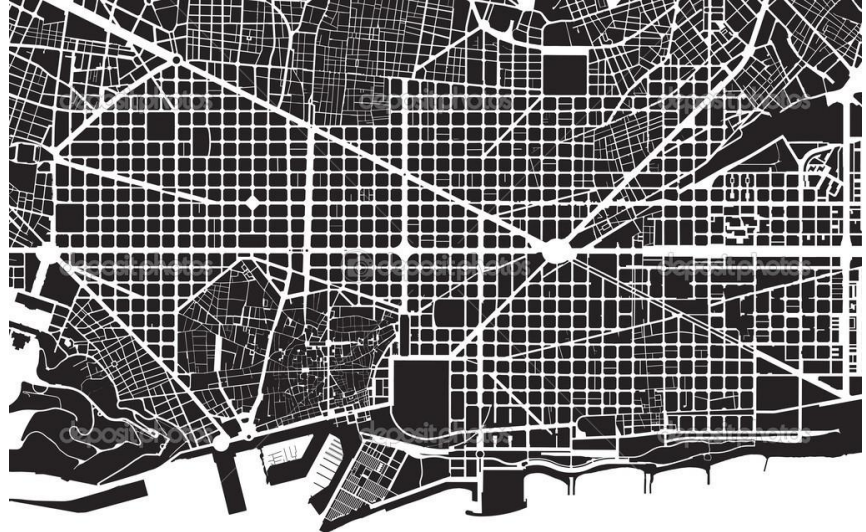
Figure 2. Solid-Void Relationship between Built and Unbuilt Spaces of Cerda Grid in Barcelona

The Cerda grid plan basically depends on continuity of infrastructures and productive and residential forms. The main goal of this idea was taken as a new modern concept of the combination of multitude of movements between inhabitants and the elements of the contemporary city, which was thought to strengthen the relationship between human, economic growth and public space. In addition, within this grid layout local streets constitute the orthogonal grid layout and diagonal avenues create territories. The streets also create built and unbuilt spaces. Big building blocks between streets were assigned as industrial or non-residential, and other square small ones were as residential functions (Busquets et al, 2009). In Figure 2, the residential uses in plan can obviously be seen as mostly square blocks. Besides, main arterial diagonals and minor cross roads create variety in urban layout in Barcelona by the formation of different-size building blocks for today's current situation. However, some serious problems have started to emerge within this strict grid Cerda plan making policy makers take new precautions on urban transport design.