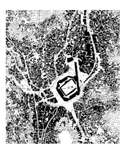
Figure 2. The major Extension of Haram in 1970.