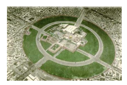
Figure 7a. Separation of shrine from its surrounding by green loop (1970s)