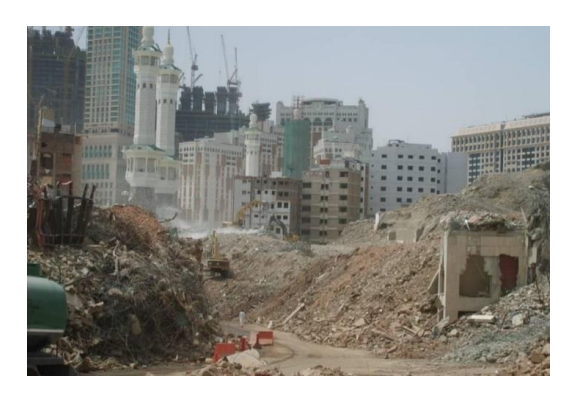
Figure 3. Demolition of historical fabric in Mecca