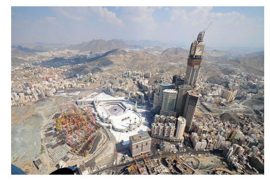
Figure 4. Development of Large-scale projects around Haram