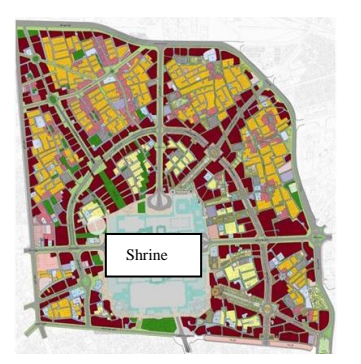
Figure 7b. Urban renewal plan of the area around shrine (1930s)