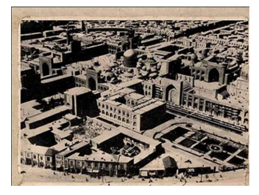
Figure 6. Construction of traffic loop around shrine (1930s)