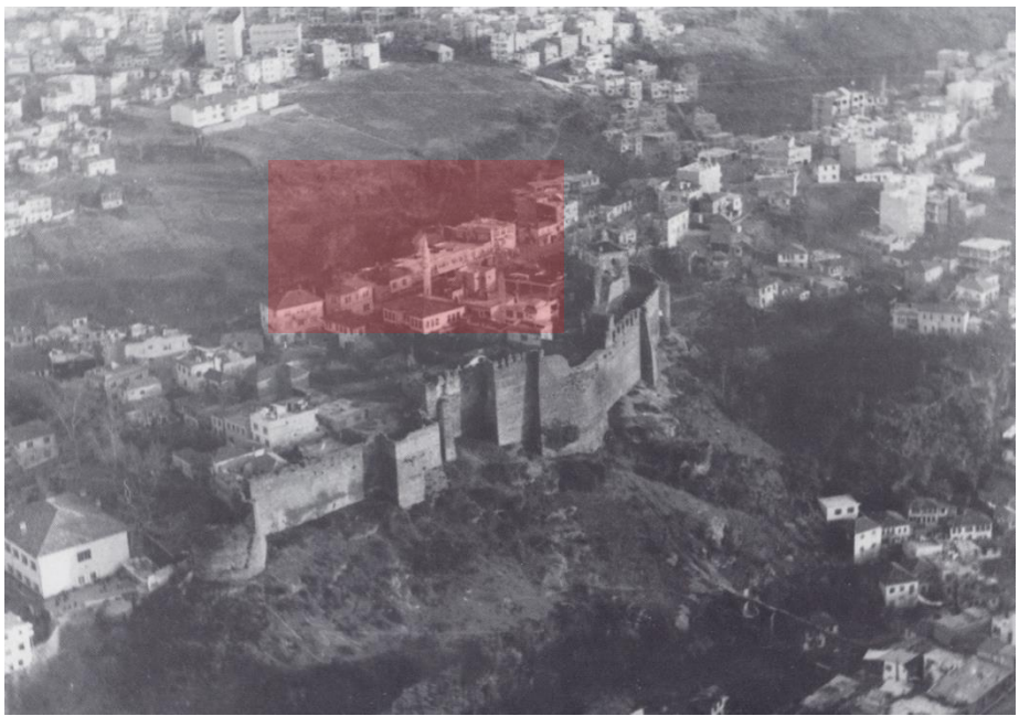
Figure 3: City Walls and İçkale Mosque, Yenicuma, 1975

to pursue the multicultural urban identity of Trabzon, are constructed along a center line which is located between two deep valleys created by the Tabakhane river in the east and the Zağnos river in the west and which specify the topography of the place from south to north. When the currently present city walls are taken into consideration, the Yukarihisar (Kule or İçkale) city walls, which are initially known to exist before the year 257, had been constructed on a high hill in the southern part. After Yukarihisar; Ortahisar, which is defined by deep valleys in the east and in the west; and the Aşağıhisar walls were constructed respectively, and thus the town was divided into three parts. With regards to this city wall system the İç Kale Mosque is located in the Yukarihisar region (Lowry 2005). What Aşık Mehmed mentions as "the fortified referred to as Kule" "where Friday prayers can be done" must be the İç Kale Mosque. <sup>3</sup>