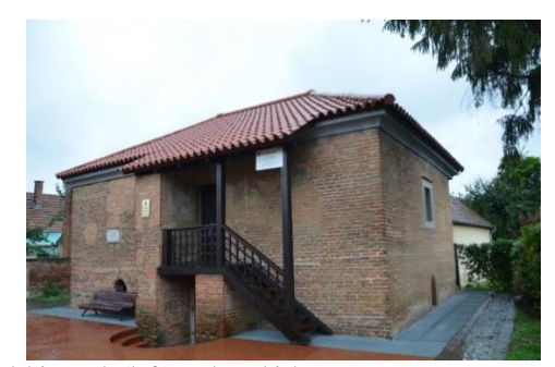
Figure 7. Hungarian-Turkish Friendship Park (left) and Turkish House Museum

In Hungary, with the foundation of the National Commission for Historical Monuments (MOB) in the end of the nineteenth century, then remained Ottoman monuments and architectural fragments started to be conserved and restored that led to sound scientific research in Ottoman architecture and later Ottoman archaeology (Molnar, 1993: 27-8). Archaeological excavations in Ottoman settlements accelerated following the Second World War (Gerő, 2003: 22). One of the praiseworthy outcomes of this earlier stage is the impressive volume titled Archaeology of the Ottoman World in Hungary , recently published by the Hungarian National Museum (Gerelyes and Kovács, 2003). Demonstration of facts through sound scientific research is cure to marginalization and humiliation of the other and also to superfluous exaltation. Growing scientific interest in Ottoman material culture and in crosscultural influences in arts are safeguards of reconstructed memories and memorials (e.g. Gerelyes, 2005; Gerelyes and Hartmuth, 2015). Constructive relocation of the Ottoman involvement in the history of Hungary is an ongoing process that we hope this paper's miniscule input on reception and reconstruction of memories and memorials will contribute.