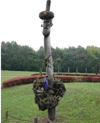
Figure 3. Historical Memorial Park of Mohács. Museum (left) and effigy of Sultan Suleiman (right)