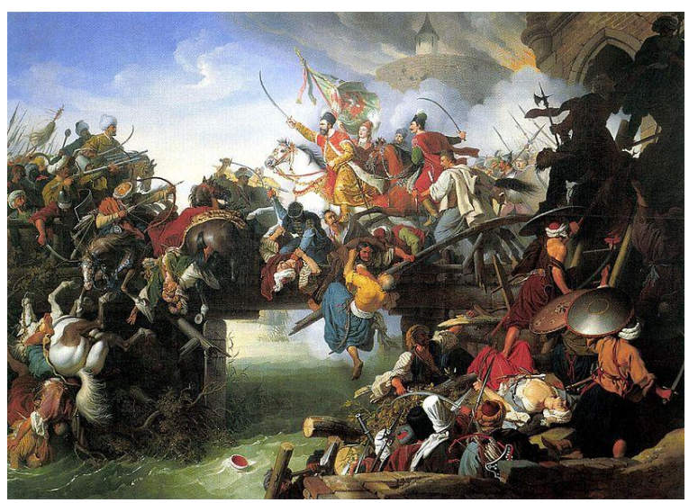
Figure 2. Miklós Zrínyi's Charge from the Fortress of Szigetvár, Painter Johann Peter Krafft (1780–1856) (Hungarian National Gallery, Budapest)

expectations. Public opinion and historians like Eckhart (2010, 120) maintain that Zrínyi sacrificed himself in order to defend his homeland and Western civilization.