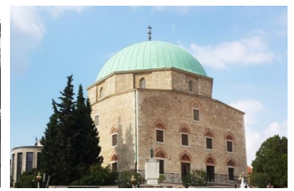
Figure 9. Gazi Kasım Paşa Mosque; from left: before the restoration; during the restoration; after the restoration

Another remarkable case is in Pécs. The Gazi Kasım Paşa Mosque (1543-64) here was converted to a Roman-Catholic Church after the recapture of the town by the Habsburgs and named Downtown Candlemas Church of the Blessed Virgin Mary. The façade of the mosque