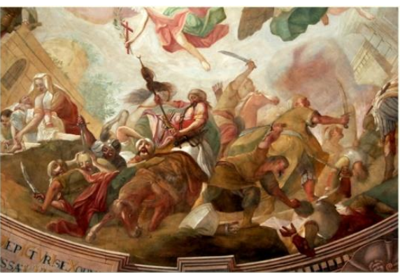
Figure 8. Ali Pasha Mosque (left); István Dorfmeister's Mural Painting (right)

The concealment of the Ali Paşa Mosque by a Baroque 'architectural screen' stirs a curious link with Christo's wrapping of Reichstag in Berlin that happened in 1995. Huyssen (2003: 36) suggests that "Christo's veiling did function as a strategy to make visible, to unveil, to reveal what was hidden when it was visible...it opened up a space for reflection and contemplation as well as for memory". Saint Roch Church in a similar fashion forcefully reveals the hidden mosque within it to those visitors who have knowledge of the Ottoman Szigetvár. Paradoxically they wouldn't much bother themselves to ponder before a mosque in a still Muslim dominated town. Ideological suppression of times past –manifested in our case with a building veiled by another building- now provokes memories instead of amnesia in an age of mass communication facilitated by digital media and tourism, which bestows unregimented intercultural explorations viable.