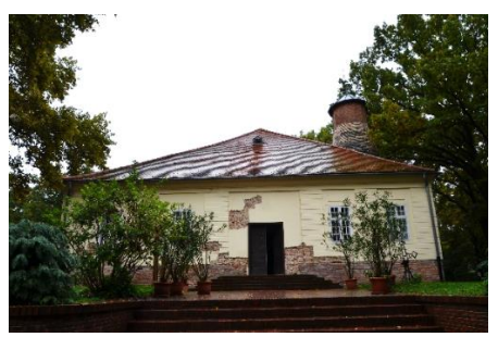
Figure 5. Zrínyi Miklós Museum (left) and Sultan Suleiman Mosque in the Fortress