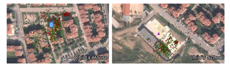
Figure 5. Physical activity counts closer to child's house and school

In brief, it is important to understand the relation between the built environment and people's (as well as children) physical activity behavior. Thus it is necessary to uncover where children are active and inactive. The simultaneous use of accelerometers and GPS devices could provide such information with some expense (such as high cost of using these devices for a long time and biased location information due to deviations in distances). Yet, this study aims to introduce a new methodology to map children's activity. Future research which develops this methodology to improve data quality (decrease distance deviations and find a better way to differentiate indoor and outdoor activities) would be a better extension of this study.