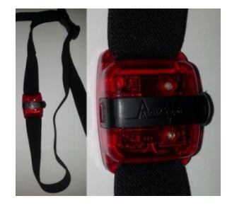
Figure 1. Accelerometer: Actigraph wGT3X-BT

Similar to pedometers, sole use of accelerometers fail to reveal information about the location of the physical activity. In the last decade, researchers began to use accelerometer with global positioning system (GPS) devices. GPS is a kind of global navigation system and provides information about the exact location of any place on the Earth based on satellite data (Kreen et al. 2011). It also sorts and stores location data (latitude, longitude) with reference to date and time. The number of studies using accelerometers to measure children's physical activity levels has been rapidly increasing (Cooper et al. 2005; Hume et al. 2005; Salmon et al. 2005; Treuth et al. 2005; Sallis et al. 2002; Cooper et al. 2003; Cradock et al. 2007; Hume et al. 2007; Baquet et al. 2007; Brockman et al. 2010; Craggs et al. 2011; Pabayo et al. 2011; Toftager et al. 2011; Van Sluijs et al. 2011). Yet, there are limited number of studies which used GPS and accelerometer simultaneously (Yin et al. 2013; Jerrett, et al. 2013; Dunton et al. 2013). In this study, accelerometers (Actigraph wGT3X-BT, ActiGraph LLC, Figure 1) were used to measure the intensity of the physical activity and GPS (BT-Q1000XT Travel Recorder XT, QStarz International Co., Ltd., Figure 2) were used to identify the location where each type of activity (sedentary, light, moderate and vigorous) took place.