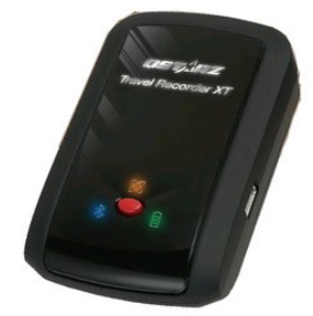
Figure 2. GPS device: QStarz BT-Q1000XT Travel Recorder XT

Similar to pedometers, sole use of accelerometers fail to reveal information about the location of the physical activity. In the last decade, researchers began to use accelerometer with global positioning system (GPS) devices. GPS is a kind of global navigation system and provides information about the exact location of any place on the Earth based on satellite data (Kreen et al. 2011). It also sorts and stores location data (latitude, longitude) with reference to date and time. The number of studies using accelerometers to measure children's physical activity levels has been rapidly increasing (Cooper et al. 2005; Hume et al. 2005; Salmon et al. 2005; Treuth et al. 2005; Sallis et al. 2002; Cooper et al. 2003; Cradock et al. 2007; Hume et al. 2007; Baquet et al. 2007; Brockman et al. 2010; Craggs et al. 2011; Pabayo et al. 2011; Toftager et al. 2011; Van Sluijs et al. 2011). Yet, there are limited number of studies which used GPS and accelerometer simultaneously (Yin et al. 2013; Jerrett, et al. 2013; Dunton et al. 2013). In this study, accelerometers (Actigraph wGT3X-BT, ActiGraph LLC, Figure 1) were used to measure the intensity of the physical activity and GPS (BT-Q1000XT Travel Recorder XT, QStarz International Co., Ltd., Figure 2) were used to identify the location where each type of activity (sedentary, light, moderate and vigorous) took place.