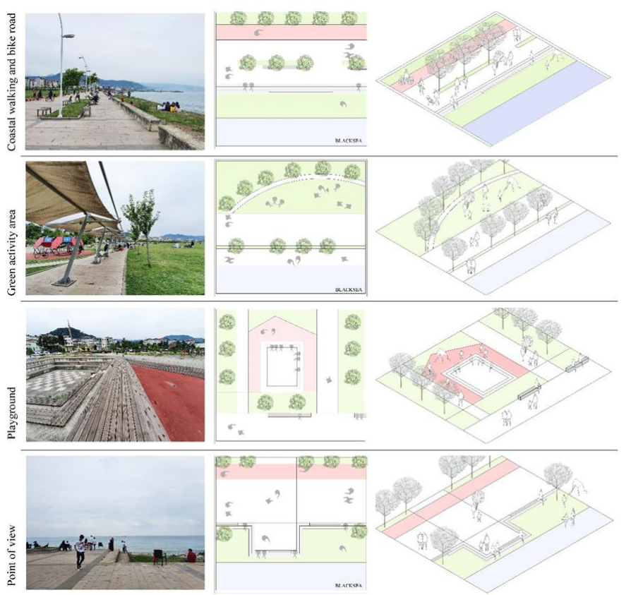
Figure 4. Variety of activities in the study area

Coastal recreation areas were built due to the increase in construction in Trabzon province and its surrounding areas and the resulting decrease in urban open places. The study area, which was designed within the context of urban transformation projects and completed in 2015, is very important in extending the potential of constantly decreasing green areas and the relationships between people and sea coast (Acar, 2015). Furthermore, Arsin Coastal Park-ACP was selected as the study area due to its diverse functional, social, and perceptual attributes, occupancy by all urban residents, and its focal location (Figure 4).