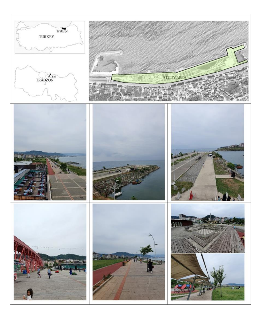
Figure 3. Location of the study area

The present study aimed to determine the effects of functional, social, and perceptual attributes of urban open places on place performance and place satisfaction via post-occupancy evaluation. The study was conducted in the Arsin district of Trabzon province, located in the Eastern Black Sea region in Turkey (Figure 3).