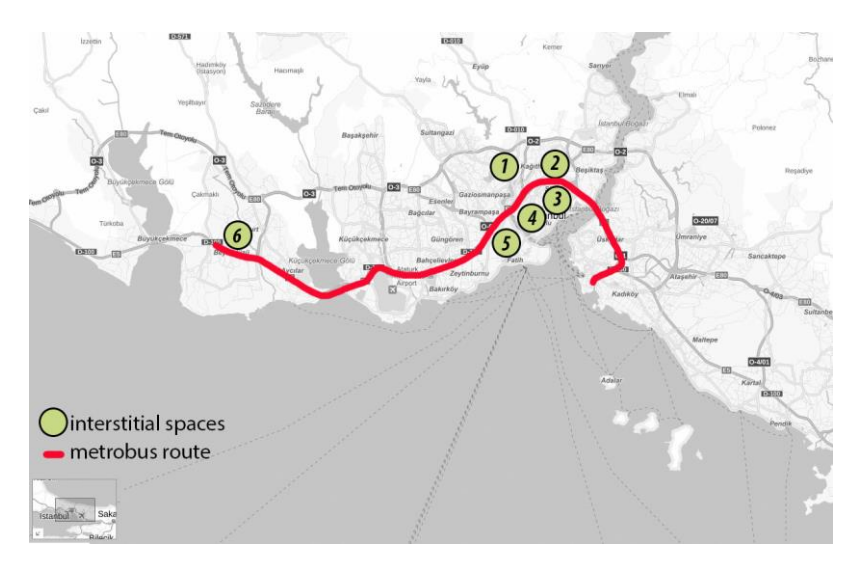
Figure 2. Case study locations along the D-100 transportation artery

connects urban peripheries to the city center, thereby manifesting urban transformation (from agricultural land to squatter, gated community, light industry, retail) during the 20<sup>th</sup> and 21<sup>st</sup> centuries. Figure 2 displays the locations of the examined interstitial cases in Istanbul. Points 1-6 illustrate the aerial photographs of the selected interstices, and their proximate streetscapes in Istanbul (Figure 3).