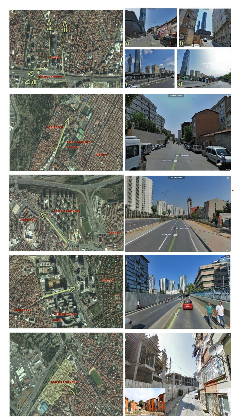
Figure 3. Case study locations along the D-100 transportation artery