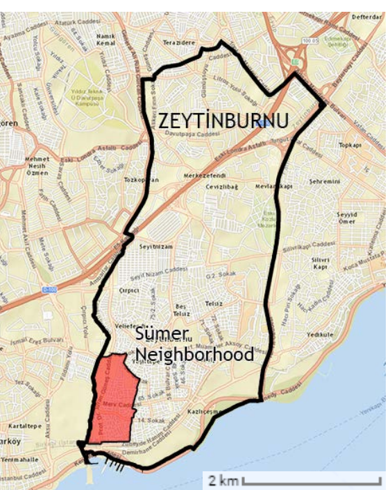
Figure 2. The Sümer Neighborhood within the Zeytinburnu district borders (Produced by author)