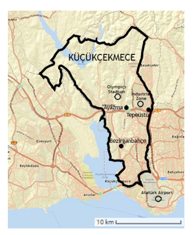
Figure 1. Ayazma, Tepeüstü, Bezirganbahçe, and other important land uses within the former Küçükçekmece district border (Produced by author)

highway arteries and junctions that connect the sites to the Atatürk International Airport and the nearby Atatürk Olympic Stadium, which was envisioned as a major focus of mega-event planning in Istanbul, an aspect of the ambitious "world city" vision of the government for Istanbul. The Sümer neighborhood is also close to a main highway and the Ataturk Airport and is easily accessible from important transport routes such as the Marmaray tunnel, the Kabataş-Zeytinburnu light rail, and the Kazlıçeşme International Seaport.