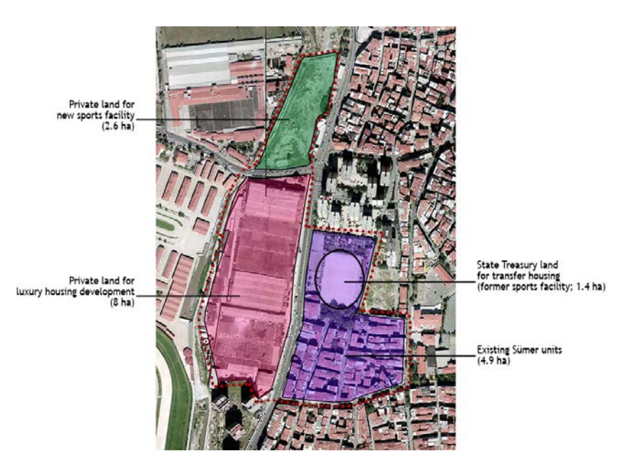
Figure 3. Components of the Sümer urban redevelopment project area (Produced by author)

1.4 ha state-owned soccer field to construct Sahilpark , a security-controlled gated housing site with street-facing stores, transfer the 3,600 residents from 1,038 units and 212 retail stores to the new units, and build the second phase on the 4.9 ha lot they vacated (Figure 3). The project also called for the concurrent development of a nearby 10.6 ha private lot to build a new sports facility and luxury housing project, The Istanbul , to generate income for the development of Sahilpark . The Sahilpark housing site was also an uplift: it offered a 25 sqm parking space to each unit in an underground parking structure, a leisure area by an ornamental pool, a playground, and an exercise station.